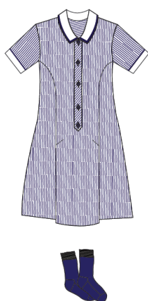
SUMMER UNIFORM CONCEPT