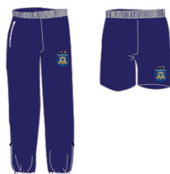
SPORTS UNIFORM CONCEPT